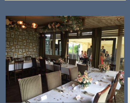
The Narrow Boat A5 Watling Street Stowe Hill Weedon Northampton NN7 4RZ